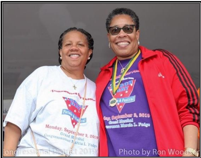
Congressional District 2019